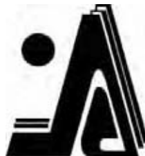
Center for Strategic Research and Development of Georgia