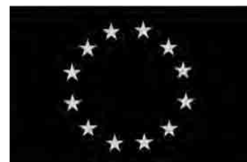
Funded by EU